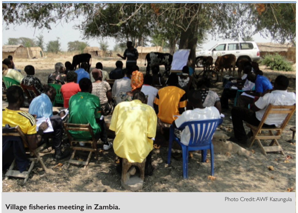
Village fisheries meeting in Zambia.